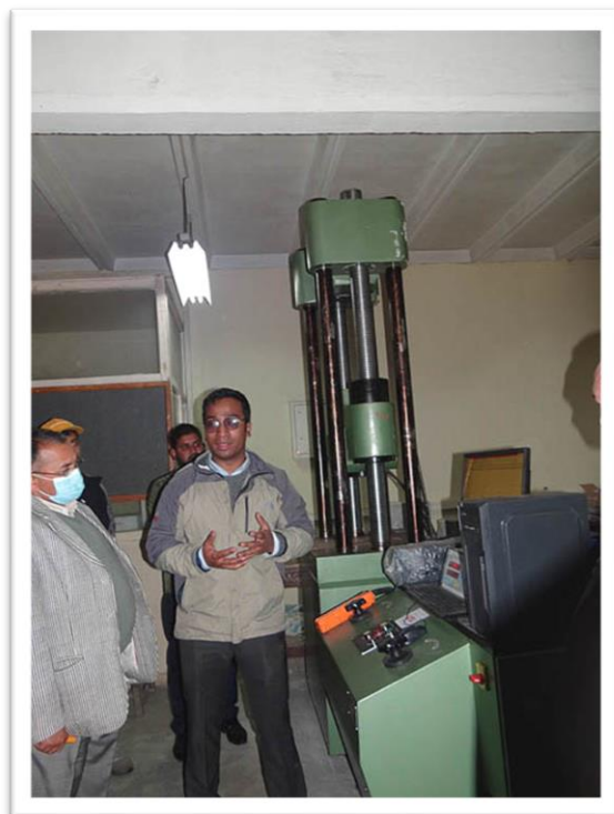
Compressive strength testing of bamboo using Universal Testing Machine