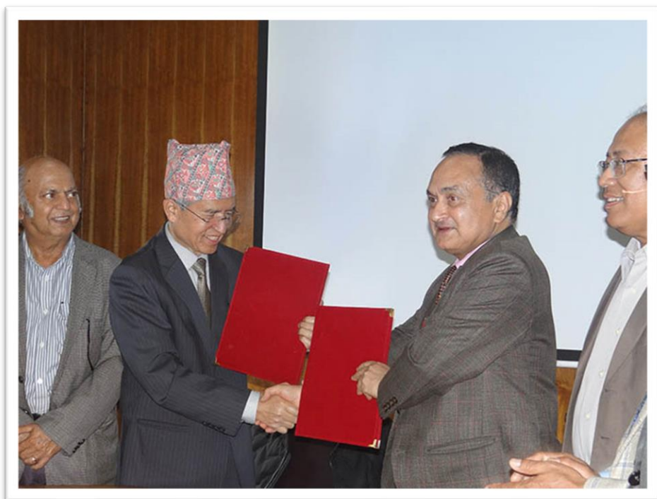
Memorandum of Understanding signing between MBUST and IOE, TU.