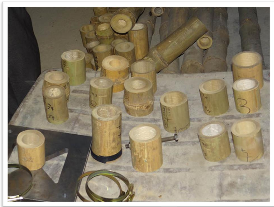
Steel plates and bamboo specimens for shear strength tests