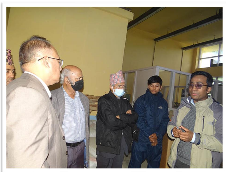
Briefing on MBUST - IOE joint research on bamboo properties