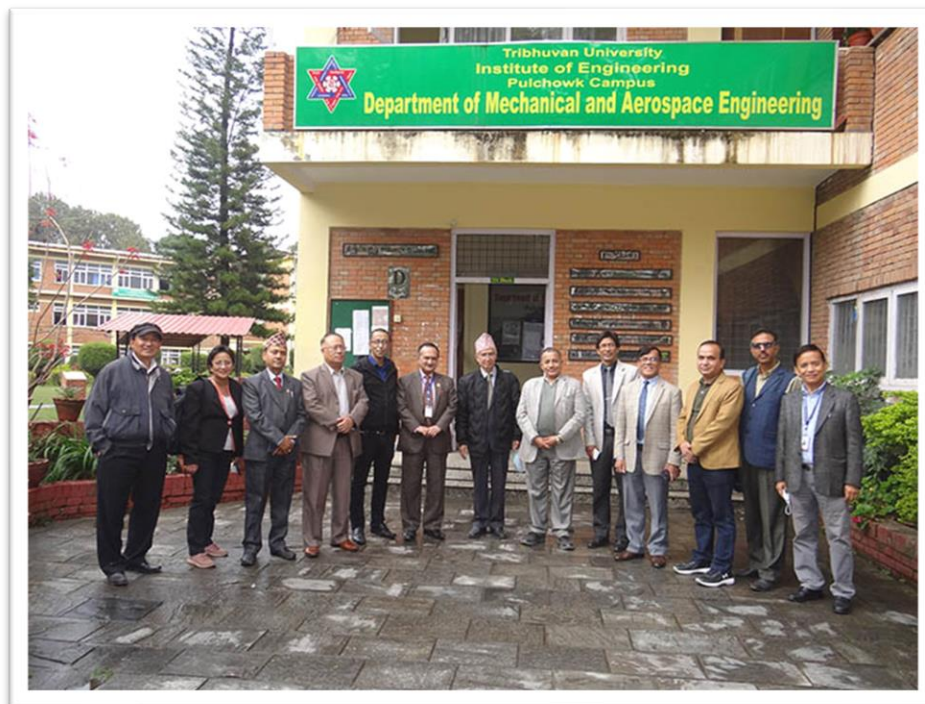
Officials from Madan Bhandari University of Science and Technology and Institute of Engineering at the IOE