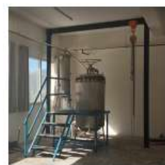
Hydro distillation unit