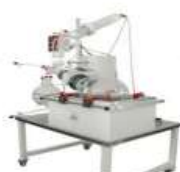
Rotary vacuum evaporator