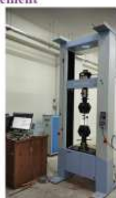
Shimadzu UTM (300 KN)