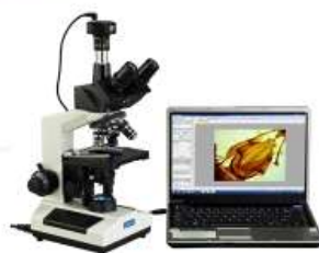
Compound trinocular microscope