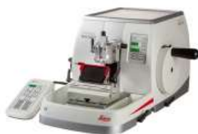
Microtome under procurement