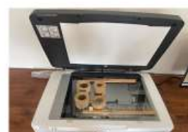
Epson Expression 13000XL Archival Scanner