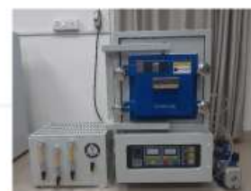
Atmospheric muffle furnace